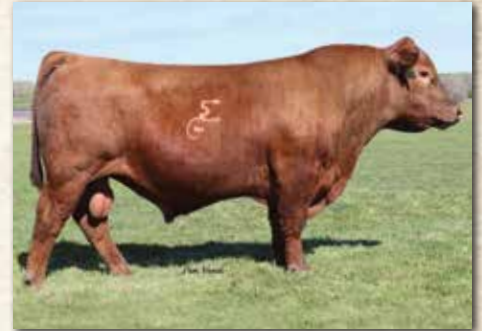
GMRA KING JAMES 0272H #4293265