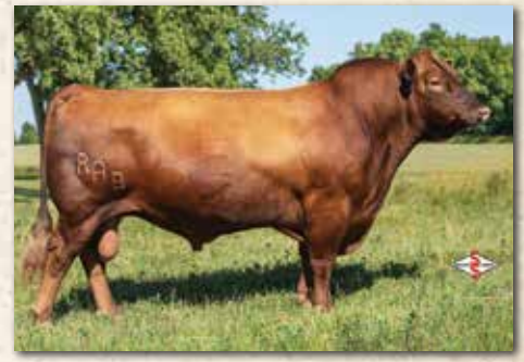
BIEBER CL STOCKMARKET E119 #3751659