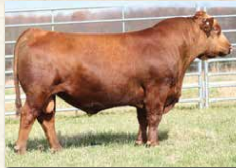
Brown PRA Patriot G6291 #4141830

To find more information on each bull go to www.redangus.org , click on the DATA SEARCHES & TOOLS tab, go to sub-category 'Animal Search' and insert registration #.