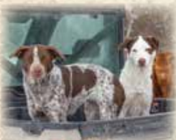
Molly & Islay Day Help