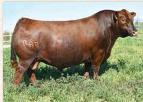
BIEBER CL ENERGIZE F121 #3958815