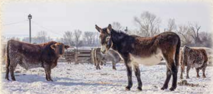
Amos Herd Sire Management