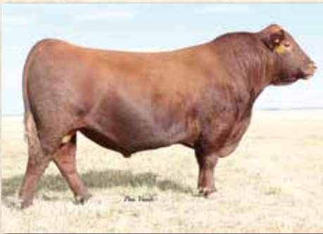
GMRA GAME CHANGER 8270F #3941443