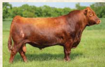
Bieber Blue Chip H302, Sire

Don't pass up this incredibly complete package. Calving ease – check! Breed-leading EPD rankings – check! High-end personal performance – check! Perfect feet and leg scores – check! Capacity, capacity, capacity – check! Great muscle expression – check! Maternal power – check! When you add it all together you get one of the most functional and versatile bulls in the offering. He's a true curve-bender with an amazing 14 of his EPDs in the top 25% of the breed. From birth through performance, he is a carbon copy of his full brother that sold last year to the Cooksley Ranch for $13,000. The cow family is second-to-none, tracing back to the Chiga foundation herd with only four MPPA's in the direct lineage under 100 for 70 years!