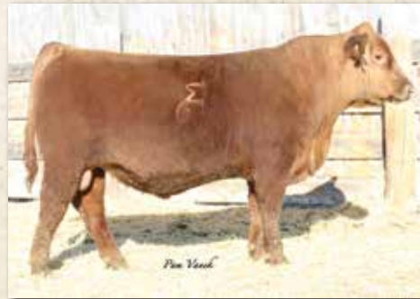
GMRA INVESTMENT 1217J #4465011