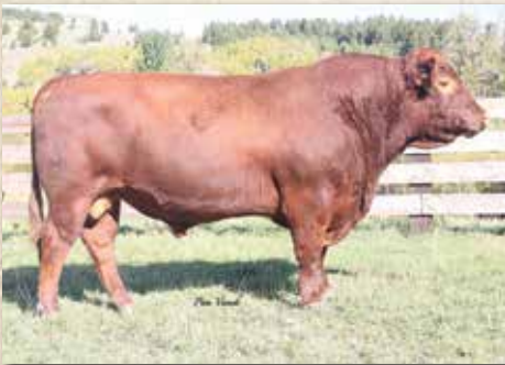
GMRA Apache 0233H #4293179