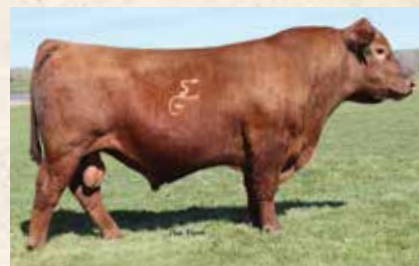
GMRA King James 0272H, Sire