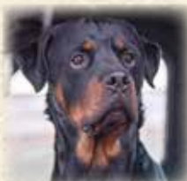
Klaus Sergeant at Arms