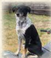
Doc 4-wheeler companion