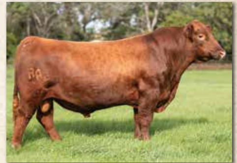
BIEBER JUMPSTART J137 #4463653