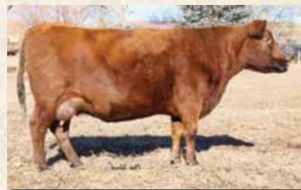
GMRA Princess 610, Dam